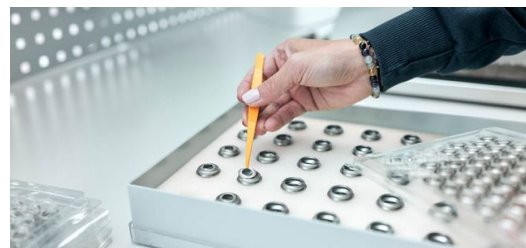
Preparation for the welding process: Placing the lenses on the stainless-steel sleeves is still manual work.