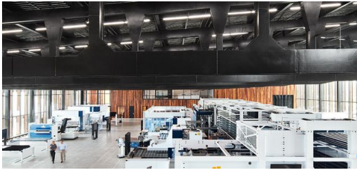
In a production hall measuring 55 meters in length, there is a connected sheet metal production with a central storage system as the centerpiece, which supplies the machine tools with material.