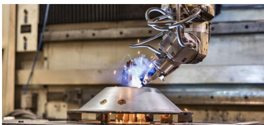
ELFIM uses the Lasercell 1005 for various applications of laser technology such as 2D and 3D cutting or welding and also for laser metal deposition.

perform a 3D scan of an existing replacement part.