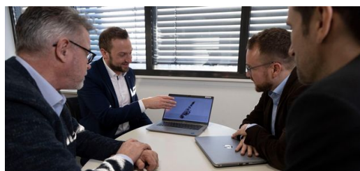
The MultiFocus optics developed by TRUMPF especially for BENTELER produce outstanding results in the pore-free, gas-tight welding of aluminum in combination with BrightLine Weld.