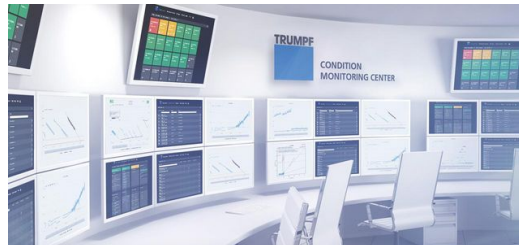
Algorithms and real TRUMPF experts then set to work transforming the data into trend analyses.