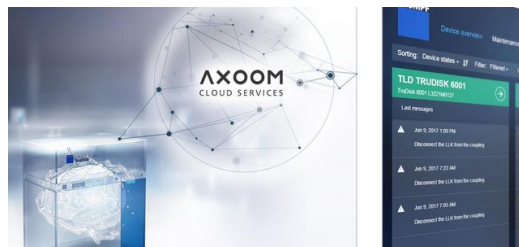
Some of the data is uploaded to the AXOOM Cloud via the Internet.