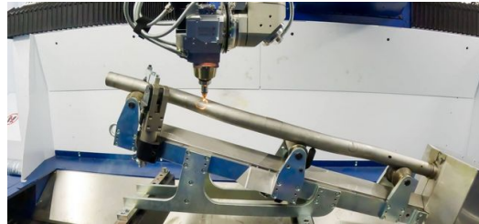
TRUMPF 3D TruLaser Cell 8030