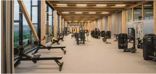
Fitness center: How's the rush hour looking on the highway? The fitness center in Ditzingen is the perfect place to check for traffic jams.