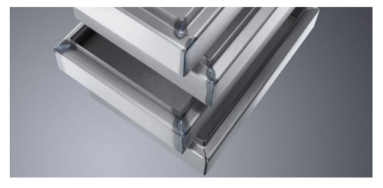
Mild steel terminal box (from bottom to top): unwelded, manual MAG weld, FusionLine weld, and laser weld after redesigning for laser processing.

What is more, the FusionLine function allows operators to join components that are not optimized for laser welding and, for instance, to uncover cracks. The results obtained with FusionLine far exceed conventional welding both in terms of the weld seam quality and the speed of execution.