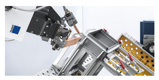
The FusionLine joining technique can be used to join parts, even when this involves the bridging of gaps. It smooths out any unevenness during the welding process and closes gaps up to one millimeter wide. That makes it possible to use the laser on many parts that were originally designed for conventional welding methods.

— Exploiting the full potential of laser welding