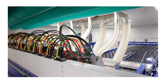
Laserlichtleitungen verbinden die Optiken mit den Lasern.