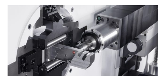
The latest version of the TruLaser Tube 7000 comes with an thread tapping system. The built-in package caters to both standard thread tapping and flow tapping.