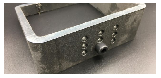
The TruLaser Tube 7000 can be used to fabricate a range of different threads in tubes.

Since the summer of 2017, the company's plant in the Swabian Jura region has been using a test unit of the TruLaser Tube 7000 laser tube cutting machine with integrated tapping system. "We are delighted to be working with TRUMPF on this kind of collaborative project, and we are certainly impressed with the new technology," says Frank Steinhart. The CO2 laser cuts tubes and profiles without leaving burrs and offers bevel cuts of up to 45 degrees, diameters up to 254 millimeters and wall thicknesses of between one and ten millimeters.