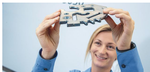
No need to grind parts after welding: EdgeLine Bevel gives parts a smooth, even surface by creating flush seams by avoiding protruding welds.