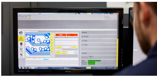
The Photonic Elements machine control software displays the ablation geometry executed during the process.

who specializes in each individual stage of component production, but we can't expect them to be an expert in every machine in the entire process."