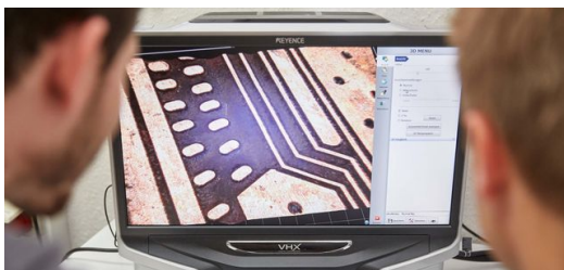
Part of the visual inspection involves documenting homogeneous ablation. The ablation zone is dark and shows the plastic surface. The key to successful machining is to ablate the gaps cleanly to provide electrical insulation between the conductive tracks.