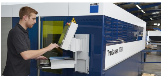
Christoph Sigel is particularly impressed by the Drop&Cut function, an unrivaled solution for quick post-production.

In spite of the fact that another machine tool manufacturer was close by, the Sigels traveled to the TRUMPF show room in Ditzingen. The quality of the specimen parts was just as convincing as the rugged engineering of the TruLaser 3030 fiber. "The machine is really made for shop use. Every detail has been thought out entirely," acknowledges Christoph Sigel. "I was particularly impressed by the Drop&Cut function, an unrivaled solution for quick post-production." Drop&Cut uses a camera to transmit a live picture of the machine's interior right to the display at the control terminal. A mouse click or touching the screen is sufficient to project the geometry of the desired part onto the remaining plate. Parts can be positioned and turned, inside the camera's field of view, on the sheet metal. Here outlines can be rotated, shifted, copied or deleted as desired. Christoph Sigel: "Post-production couldn't be any easier."