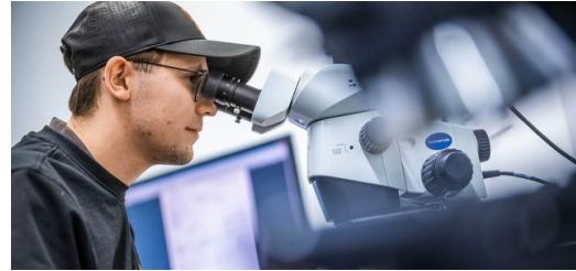
<p>Tireless efforts to enhance and innovate — that keeps customers happy and won the company a "Bavaria Best 50" award in 2023.</p>