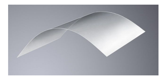
Outstanding edge quality in ultra-thin glass.