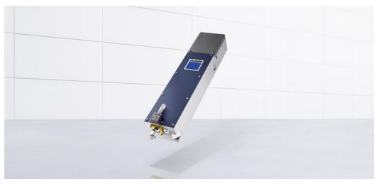
The TOP Cleave optics spread the power of an ultra-short pulse laser along the beam axis, creating a focus line. This increases by a hundred-fold the speed of separating glass using material modification, to one meter a