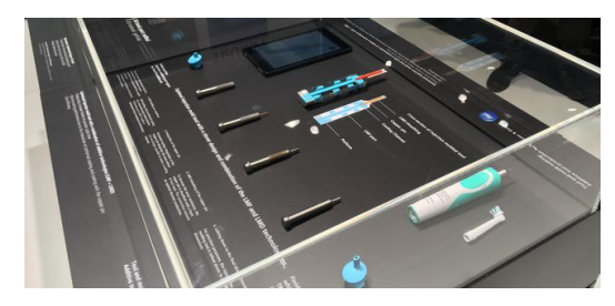
Who would have thought? 3D printing also changes toothbrushes - at least in their production. The new tool for the plastic attachment has been produced additively.