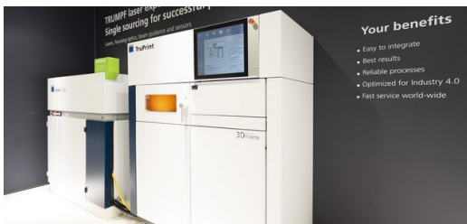
<em>TRUMPF prints copper and gold with a new green laser</em>

For another first at Formnext, TRUMPF printed pure copper and gold using a green laser. The company's developers achieved this by linking the new TruDisk 1020 disk laser and TruPrint 1000 3D printer. The former's wavelength is in the green spectral region, and unlike infrared lasers, it is able to weld highly reflective materials such as pure copper and gold. None of the expensive material goes to waste, which the jewelry industry is sure to appreciate. And the electronics and automotive industries benefit from components made of pure copper, an excellent conductor of electricity and heat.