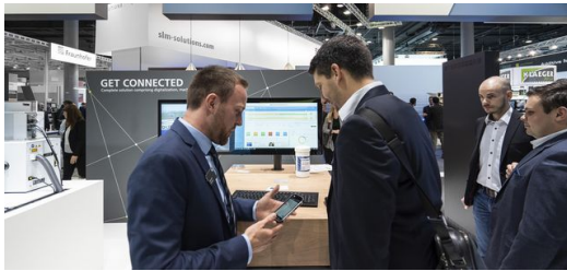
<em>All 3D printers at the exhibition stand were connected to a digital MES</em>

learn how much it will cost to produce the component and how long delivery will take. On top of that, the manufacturer can access the printers and the pending jobs' process data from anywhere in real time.