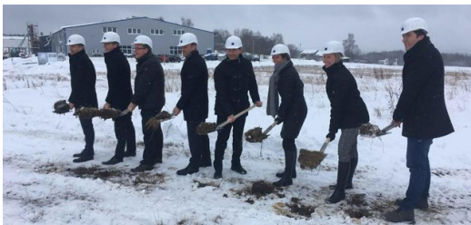
<p>The ground-breaking ceremony for the new production hall at the TRUMPF site in Hettingen in January 2019. 120 employees are to move into the competence center in two years.</p>