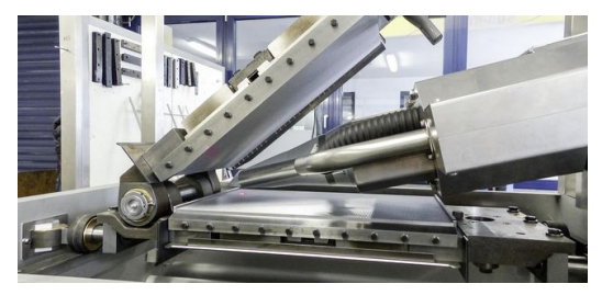
Despite the lack of space between the baking plates, the laser cleans them quickly and reliably.

Having now found the right tool and process, the next step for Kalss was retrofitting the laser for its new day job as a cleaning agent in a wafer factory. He called on systems integrator Robert Binder to help him solve a seemingly contradictory problem. "In our ovens, the baking plate pairs only open up to an angle of 30 degrees. This prevents excessive heat loss when the batter is poured in or the wafer sheets are removed," says Kalss. "But in order to clean our ovens, we require the surfaces to be as accessible as possible."