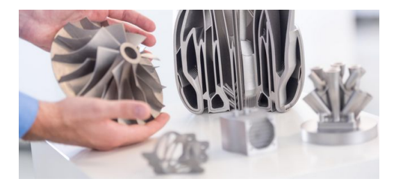
Aerospace, Automotive or Medical: The applications for 3D printing are just as diverse as the technologies and materials. But what are the main trends?

Another aspect of the trend toward multiple elements is the idea of combining 3D printing with other machining methods in a single machine, for example with milling and drilling. Unfortunately, that typically ends up transforming the unquestionable marvels of 3D printing into an annoying drag on the other built-in processes. Right now – and even in the longer term – the difference in processing speeds between 3D printing and traditional methods is simply too great to offer any good reason for combining them in the same machine. That is no longer the case for other additive manufacturing methods, however, such as laser metal deposition.