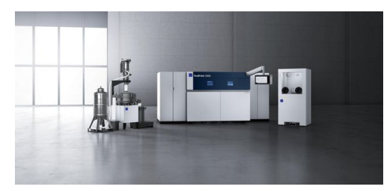
How much automation does 3D printing need? Currently, rather large companies ask for complete automation solutions. Classic job shops prefer to operate the systems alone.