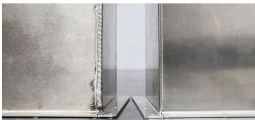
Werner Neumann's expectations in regard to the reduction in retouching work were satisfied completely by laser welding. For some parts the touch-up time could be reduced from twelve hours to just 90 minutes.

Here they count on our expertise right from the part design phase," says Neumann. The best example is a U-shaped aluminum profile with close fit areas, holes and notches. In the past this was milled from solid material. "Now we cut the parts with the laser and deep-weld them at the base. Thanks to the low degree of thermal input, there is no distortion. We brush over the seams and thus save 95 percent of our previous costs. It goes without saying that the customer is thoroughly satisfied," Neumann reports.