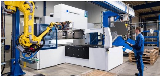
The new TruBend Center 7020 panel bender made production of the field stove possible in the first place. Only with this equipment was the team at Kuipers able to automatically bend the relatively large firebox of 333 millimeters.