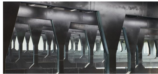
The Skywalk is part of the cantilevered ceiling structure that is manufactured by a TRUMPF customer in Atlanta.