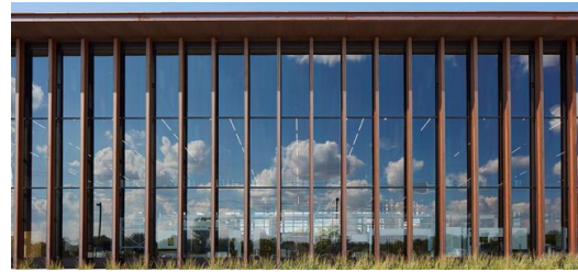
The focus of the Smart Factory is to advise and train customers on the introduction of digitally connected production solutions.