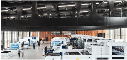
In a production hall measuring 55 meters in length, there is a connected sheet metal production with a central storage system as the centerpiece, which supplies the machine tools with material.