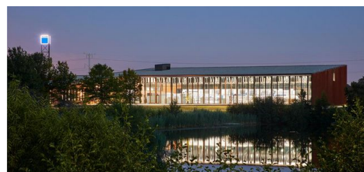
The construction costs of the 5,500 square meter building estimated at about 13 million euros. It was designed by the Berlin architectural office of Barkow Leibinger.