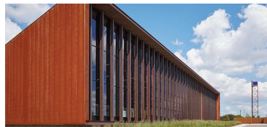
The building links the history of the "Rust Belt" as the oldest and largest industrial region in the USA with high-tech digitally connected production.