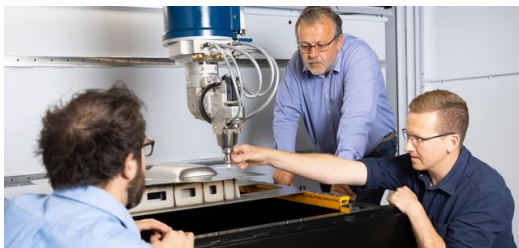
<p><span lang="EN-US">Discussing, arguing and seeking solutions together: the good cooperation between sons and father has taken the company a long way, on course for the Smart Factory.</span></p>