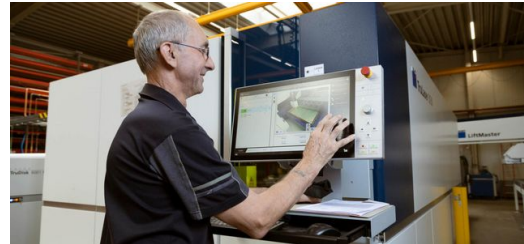
<p><span lang="EN-US">A TruLaser 3030 is loaded and unloaded semi-automatically with a LiftMaster.</span></p>