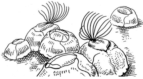
<p>Barnacles (Balanidae) are arthropods that belong to the subphylum Crustacea. These sessile animals live primarily in coastal waters, though some species of barnacle live in deeper regions of the ocean. They use their feather-like appendages to fish for microorganisms and suspended particles.</p> – Jürgen Willbarth / Die Illustratoren