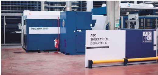
The TruLaser 3030 fiber 2D laser-cutting machine laid the foundations of AEC Illuminazione's close partnership with TRUMPF. Its connection to an automated storage system made production much faster.

achieve this, Bianchi has now connected up 85 percent of the company's machines. The MES generates production schedules and ensures smooth operation of the manufacturing environment. The design engineers can send their CAD drawings straight to the machines, where the data is imported and turned into finished parts as and when they are needed. The MES also collects machine data and key metrics for quality monitoring, machine utilization and production status. "By connecting everything together, we've created a truly transparent production environment. Tailoring our production schedules to the needs of our employees and machines helps to shorten throughput times and improve on-time delivery over the long-term," says Bianchi.