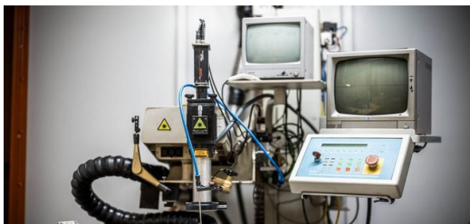
<p>Proven technology remains in service. In parallel, BBW Lasertechnik continues to invest in the latest laser systems and steadily expand its portfolio.</p>