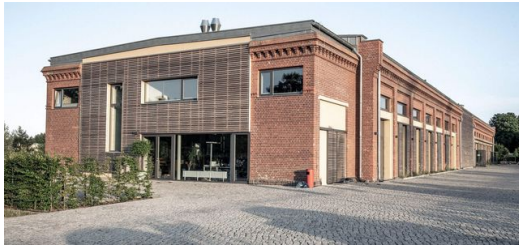
The Potsdam-based company Miethke produces high-tech medical devices that are implanted in people's brains and bodies.

That sparked his interest in the whole issue of surfaces. "Right now we're experimenting with ways of using the laser to create hydrophobic and hydrophilic surfaces on our parts. It seems that once you get hold of an ultrashort pulse laser, you are constantly finding new things you can do with it!"