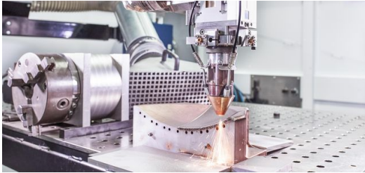
<p>Time to process the order – a TRUMPF laser applies a metal layer onto a tool for a press in the automotive industry.</p>