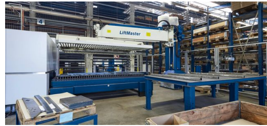
A Stopa storage system takes care of supplying materials while a LiftMaster makes it easier to handle parts.