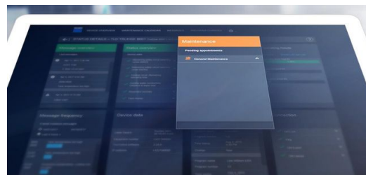
All data forwarded from the laser systems is reported to Daimler using encrypted data connections.