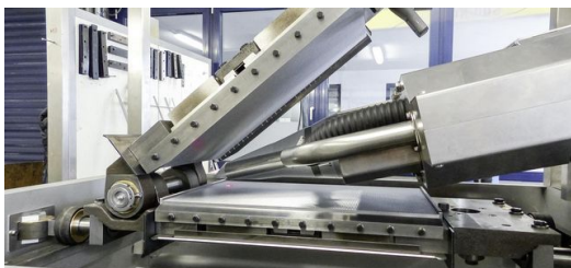
Despite the lack of space between the baking plates, the laser cleans them quickly and reliably.

Having now found the right tool and process, the next step for Kalss was retrofitting the laser for its new day job as a cleaning agent in a wafer factory. He called on systems integrator Robert Binder to help him solve a seemingly contradictory problem. “In our ovens, the baking plate pairs only open up to an angle of 30 degrees. This prevents excessive heat loss when the batter is poured in or the wafer sheets are removed,” says Kalss. “But in order to clean our ovens, we require the surfaces to be as accessible as possible.”