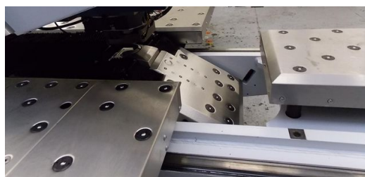
Before and after: old TRUMPF machine after overhaul.