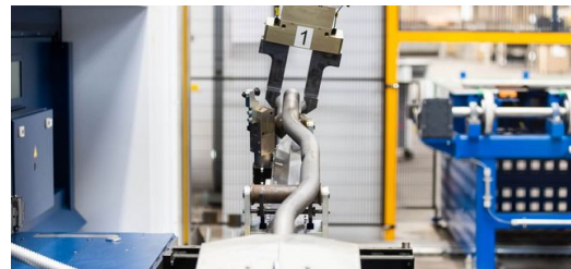
The systems in the machine network are automated by a robot system, which automatically transports the parts from one processing step to the next.