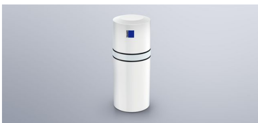
<p>Satellite: Satellites installed in the production facility pick up the markers' location and transmit the information to an industrial PC.</p>