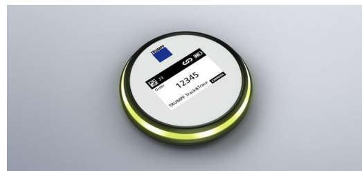
Marker: Users can transfer the order number and other information digitally onto the e-ink display of the marker. They can then simply place them on or beside the parts of the order.