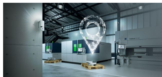
<p>This enables sheet-metal manufacturers to track orders, load carriers and means of transport and thus optimize processes.</p>