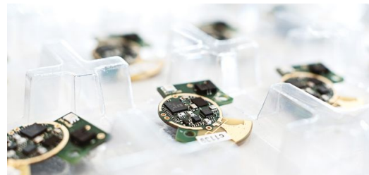
<p>Ever smaller chips: A crucial part of the process.</p>