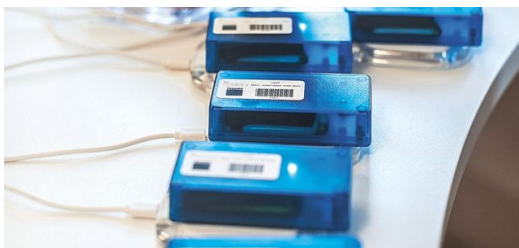
Prototype: What the markers looked like during the test phase.