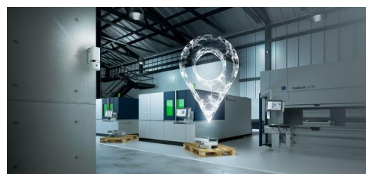
This enables sheet-metal manufacturers to track orders, load carriers and means of transport and thus optimize processes.