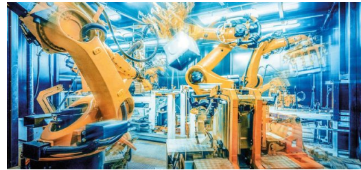
For this to work, the production needs highly flexible, easily controllable tools.