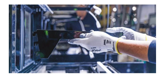
Jordão was looking for a machine to automatically bend small metal parts for chiller counters more quickly.

Jordão is synonymous with innovation blending technology and sustainability. The company supplies digital, efficient and environmentally friendly solutions that help customers to reduce their energy consumption while presenting their food. Last autumn, one of its products even won an innovation award at a leading global trade fair for the catering and hotel industry.