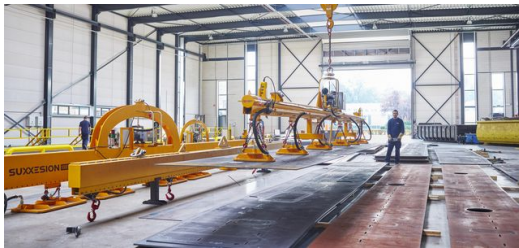
The Spanish eye-catcher cuts giant sheets and plates for truck bodies, ship hulls and buildings (Photos: Norbert Voskens).

Two cutting heads dance across the sheet, cutting the specified shapes. Both of these optical systems are mounted on a single portal that moves over the sheet in the direction of cutting. As soon as a sheet has been cut, the roller gates ascend and the booth moves on to the next sheet. "This approach allows us to cut five or even ten sheets in one go, depending on sheet size."