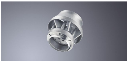
Flexibility: Additive manufacturing enables the flexible production of components without using tools.