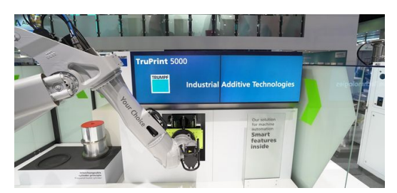
Thanks to its flexible automation interface (currently still a future idea), the TRUMPF TruPrint 5000 is compatible with a variety of industrial and production scenarios and can be quickly and easily connected to, for example, an automated robot solution, a rail system or an autonomous vehicle, depending on the factory concept.

Not only the number but also the choreography of the three lasers are decisive for the high productivity of the system: they can illuminate every corner of the construction chamber independently of each other and independently of one another, thus producing components much faster and more efficiently. This is not the case with other multilaser concepts.