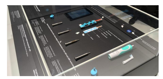
Who would have thought? 3D printing also changes toothbrushes - at least in their production. The new tool for the plastic attachment has been produced additively.