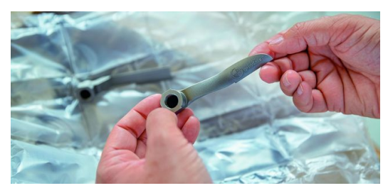
All one piece: Redesigned by Bionic Production, this nozzle offers gentle curves straight from the 3D printer.

The new nozzle is efficient in many different respects. The flow of coolant has been optimized, reducing pressure losses by up to 20 percent. That means you need a lower pressure - and less energy - to achieve the specified coolant exit velocity. The curved channels and optimized jet trajectory take the lubricoolant to the precise place it is needed, delivering no more and no less than is required to carry out the process in an optimum manner without causing thermal damage to the part. This reliable and automated solution for delivering lubricoolant eliminates factors that may have previously caused hold-ups in the manufacturing process.