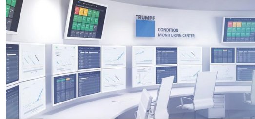
Algorithms and real TRUMPF experts then set to work transforming the data into trend analyses.