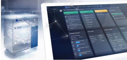
TruDisk disk lasers collect data derived from the lasers, processing optics and process sensor.

To supplement the expert knowledge of TRUMPF's employees, Smart View Services have been introduced. These enable Daimler employees to detect and resolve many minor anomalies on their own, thanks to the user-friendly live overviews provided in the central customer portal. Anyone with access to a PC or smartphone can check the status of the plant, at any time and from anywhere in the world. As a result, the availability of the laser welding machines has increased significantly.