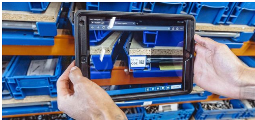
<p>At every workstation, employees record each stage of work from initiation to completion using tablets and a dedicated app. This mobile access to information streamlines daily work routines and enhances transparency in the processes.</p>