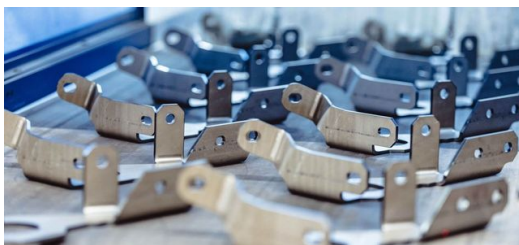
<p>MERZ's in-house sheet metal processing facility handles between 10 and 15 tonnes of thin sheet every day across three shifts. Dealing with a wide range of parts, with quantities varying from 1 to 1,000 , and facing significant deadline pressures are daily challenges.</p>