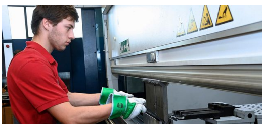
Assistance systems and software help with the work: The TruBend 5230 in use at the Fischer company.