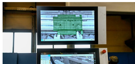
If the Part Indicator shows green, the bending part has been correctly positioned. Thanks to this function, Fischer Maschinenbau has been able to minimize scrap in their sheet metal processing and increase speed.