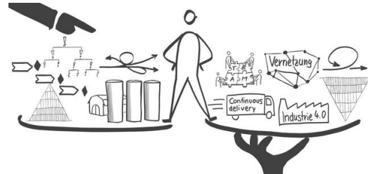
For a flexible organization, you need both stability and agility.