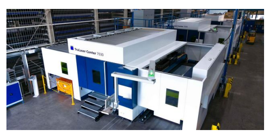
cp class="MAGAFlietext">Automation and digitalization are the keys to success at VDL. The current installation of the three TruLaser 7030 full-service laser machines from TRUMPF aligns perfectly with this approach. They handle all laser cutting processes fully automatically.