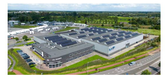
VDL Technics, located in Boxtel, the Netherlands, is a subsidiary of the VDL Group, specializing in the manufacturing and series assembly of complex metal assemblies.