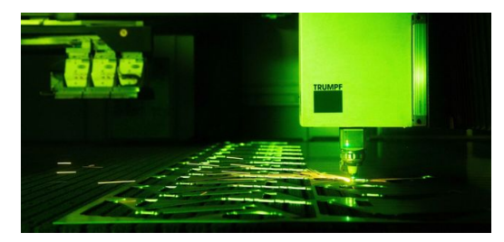
>Hans Sanders considers process reliability to be of paramount importance, and he is particularly impressed by the safety features incorporated into the TruLaser Center 7030. As an example, the SmartGate integrated into the brush tables prevents parts from tipping over during the cutting process.