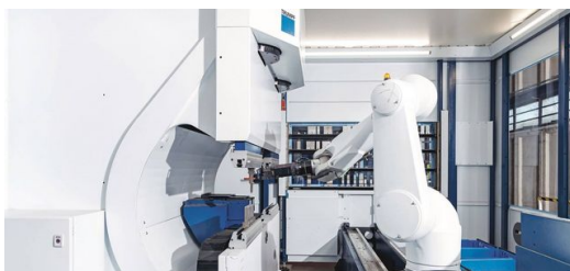
<p>Innovative high-speed bending cell: The TruBend Cell 7000 is a compact system that offers highly dynamic, cost-effective bending solutions