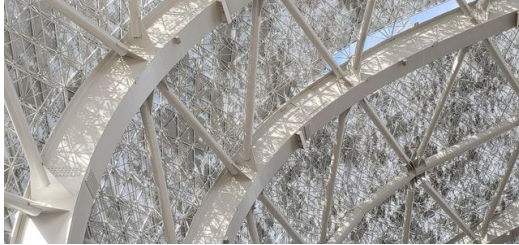
The perforated panels allow light and air to pass through - it was the architects' ambition to build an open arena in which people are nevertheless protected.