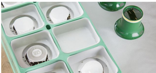
In the new generation of TruMicro Mark Series 2000 ultrashort pulse lasers, the pulse duration can be variably set between 400 femtoseconds and 20 picoseconds. This enables fast, burr-free engraving of up to 100 micrometers deep in all precious metals that can be reproduced at any time with consistent quality.