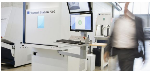
The edition engraving for the Meister S Chronoscope Platinum Edition 160 was created in a TruMark Station 7000 equipped with the new generation TruMicro Mark Series 2000 ultrashort pulse laser.

Clearly, everything about this timepiece must be perfect down to the smallest detail. The case, pushers and screw-down crown of the Meister S Chronoscope are made of highly polished platinum. The hour counter of the stopwatch, integrated into the cool silvery shimmering dial, bears the limitation number, as does the watch back. "Each watch is absolutely unique," says Stotz with enthusiasm. "The 12 numbering on the dial and the edition engraving with limitation number on the watch back make it unique. To ensure that this unique selling point is also perfect, we turned to our contact Ralf Motz at TRUMPF."