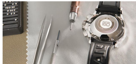
"A watch is simply not finished without the engraving," explains Matthias Stotz. The anniversary engraving is unmistakable with its fine structures, clean lettering and individual limitation number.