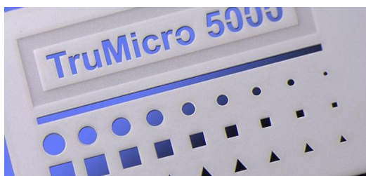
With regard to bezels and watch casings made of ceramic: no tool other than an ultrashort laser beam can create contours like these with such speed and precision.